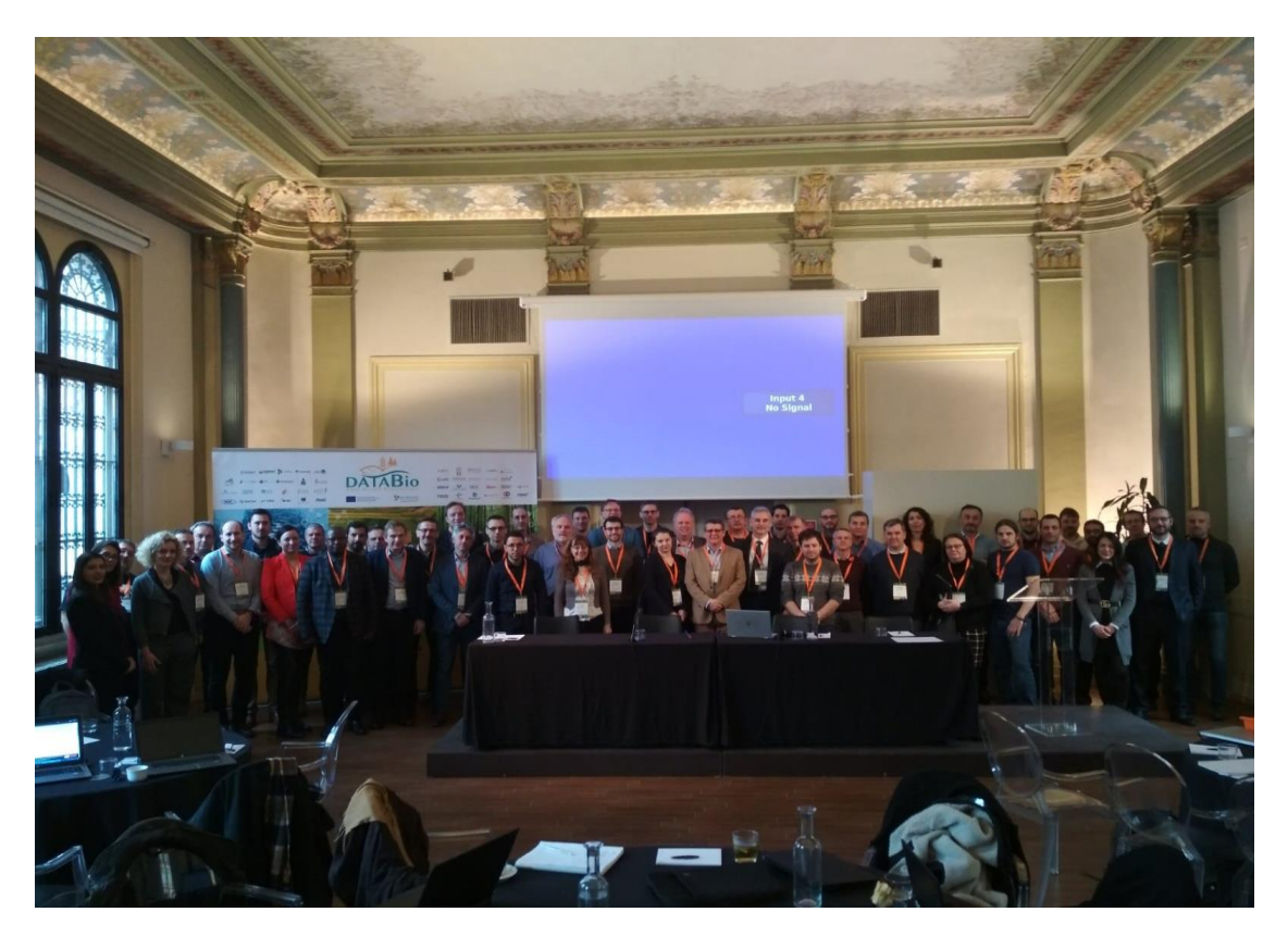
Sixth Congress of the Project DataBio in Bologna

The main objective of the DataBio project is to demonstrate the benefits of Big Data technologies in the production of raw materials from agriculture, forestry and fishing/aquaculture in Bio-Economy, to produce food, energy and biomaterials responsibly and sustainably. DataBio proposes to implement the latest generation Big Data platform, through the integration of infrastructures and technologies provided by individual partners: the Big DATABIO platform. The project, active since 2017, is implemented by 48 partners distributed in 18 countries between the EU and Israel. The project has already produced more than 90 Big Data technologies, implemented in 26 pilot studies ranging from agriculture/forestry to fishing/aquaculture. To date, more than 100 associated stakeholders are actively applying